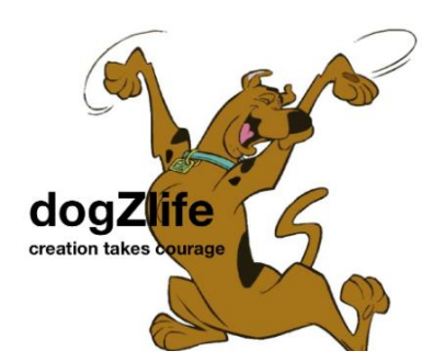
NuVoWay Foundation Community Matters